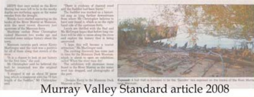
Murray Valley Standard article 2008